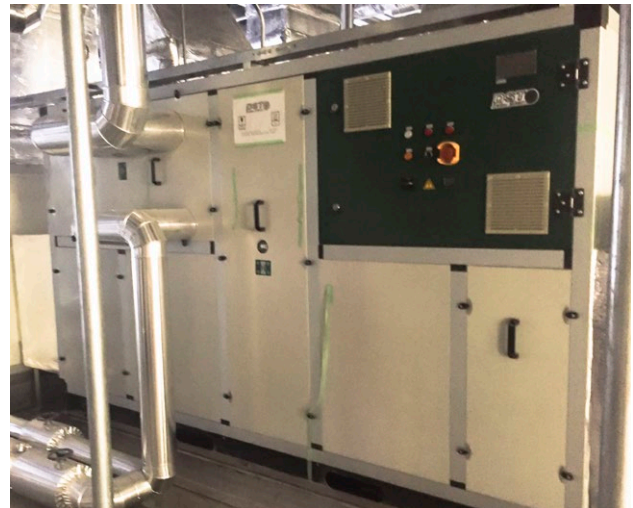
DST RFA-172 installed at Angel Yeast corporation

DST China's first contract with Angel Yeast consisted of two RFA-172 steam regenerating units, each pushing 20,000 m 3 /h of dry air into their new facilities. Which easily met their humidity control requirements with virtually zero maintenance needed during the first two years of operation.