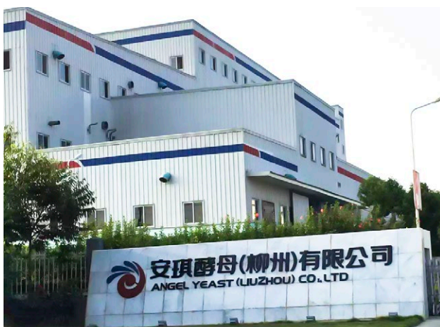
Angel Yeast Co., Ltd

In 2012 the Wuhan office of DST China was approached by China's largest yeast producer: Angel Yeast Corporation. Their anticipated output is projected at 20,000 tons annually, consisting primarily of high-active dry yeast. Which should all roll off of a production line controlled at absolute humidity of 2 g/kg. Angel Yeast engineers were primarily concerned with maintaining constant environmental stability, with emphasis on reliability of the machinery used to maintain that environment. The client had experienced excessive stoppages due to inadequate and poor quality machinery in the past and was keen to avoid repeating it and to get a more efficient production.