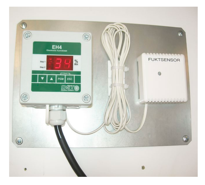
EH4, elektronic humidistat with fast response capacitive type moisture sensor

Condensation is essentially impossible to remove by heating or venting. Sorption dehumidifiers work just as efficiently in the summer as during the colder winter months; unlike condensation dehumidifiers, which loose capacity below 15°C.