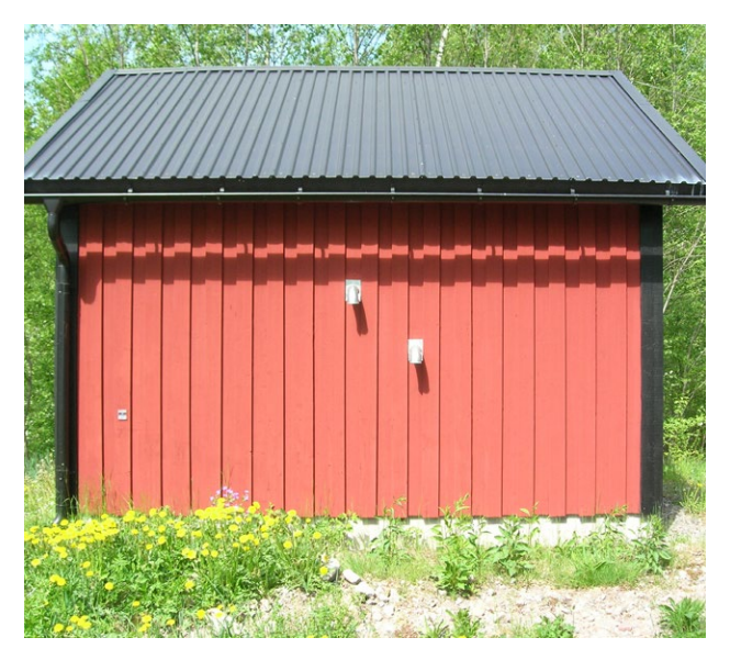
Wet air is fed out outside the booster station and regeneration air enters