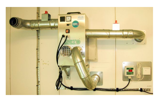
A DR-010B with DST humidistat EH4 controls moisture at a booster station

There was an improvement once the dehumidifiers had been installed in the stations. Condensation no longer drips from the pipes, documents for notes in the rooms